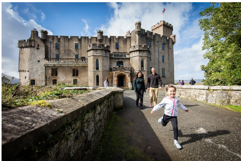
Dunvegan Castle, domain of the MacLeods. (Dunvegancastle.com)