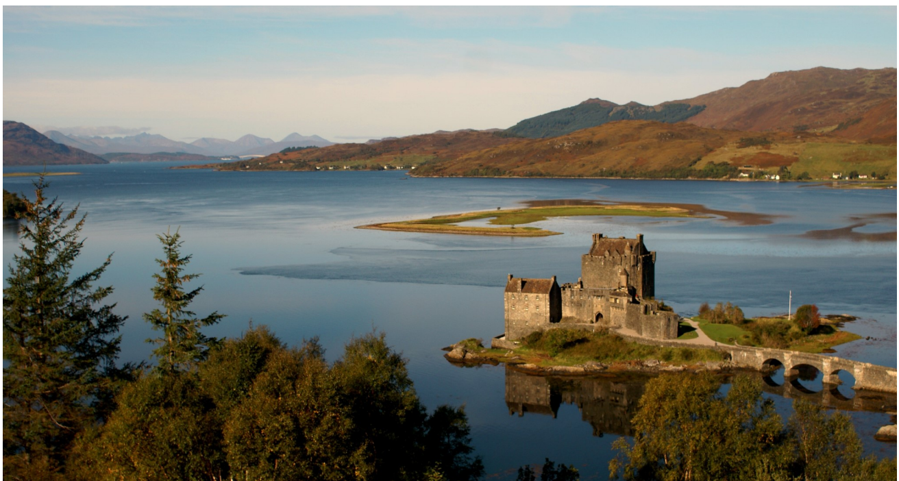
Eilean Donan Castle, Skye and the Cuillins in the far distance