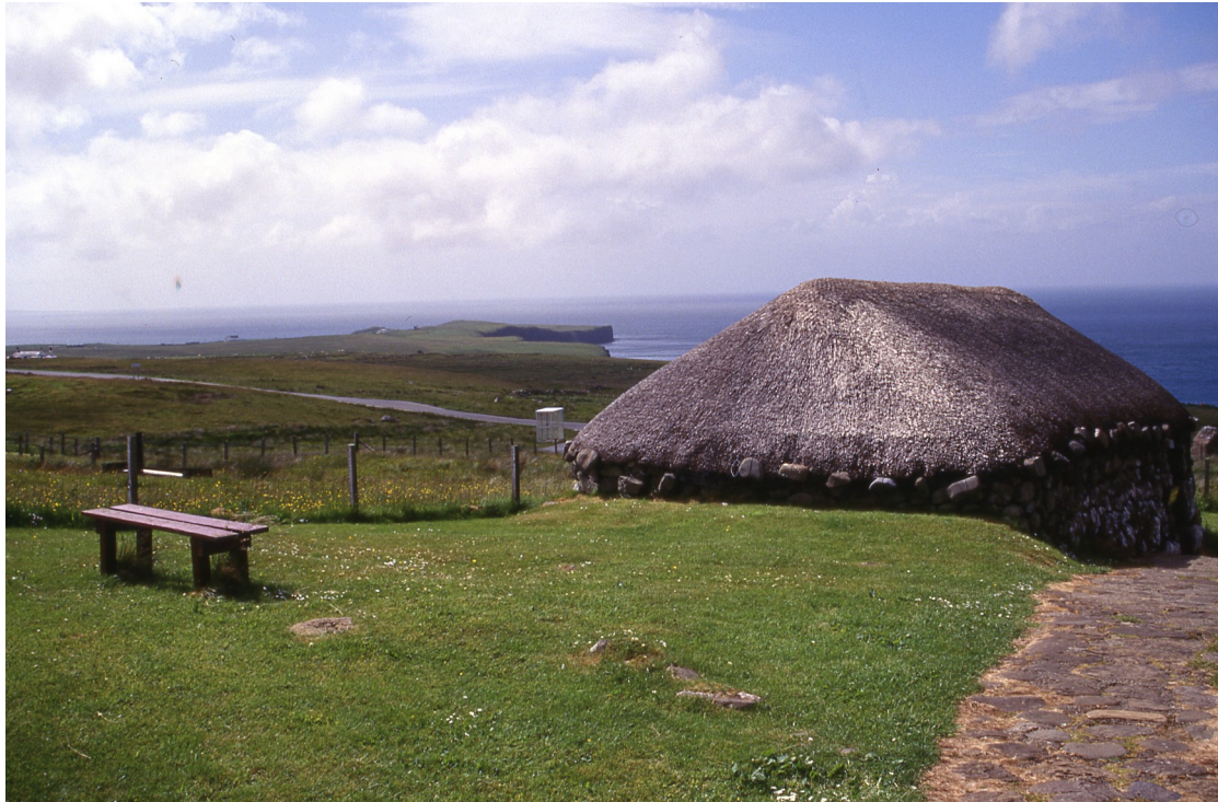
Museum of Island Life, Skye, taken in 2001