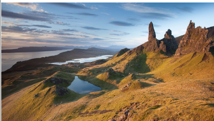
The Quiraing, Skye. You can walk to this spot