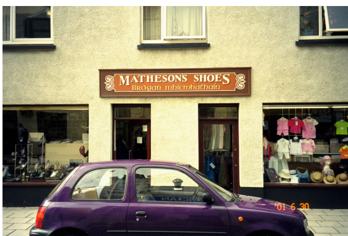
Mathesons Shoe shop, Portree, Skye. Taken in 2001.