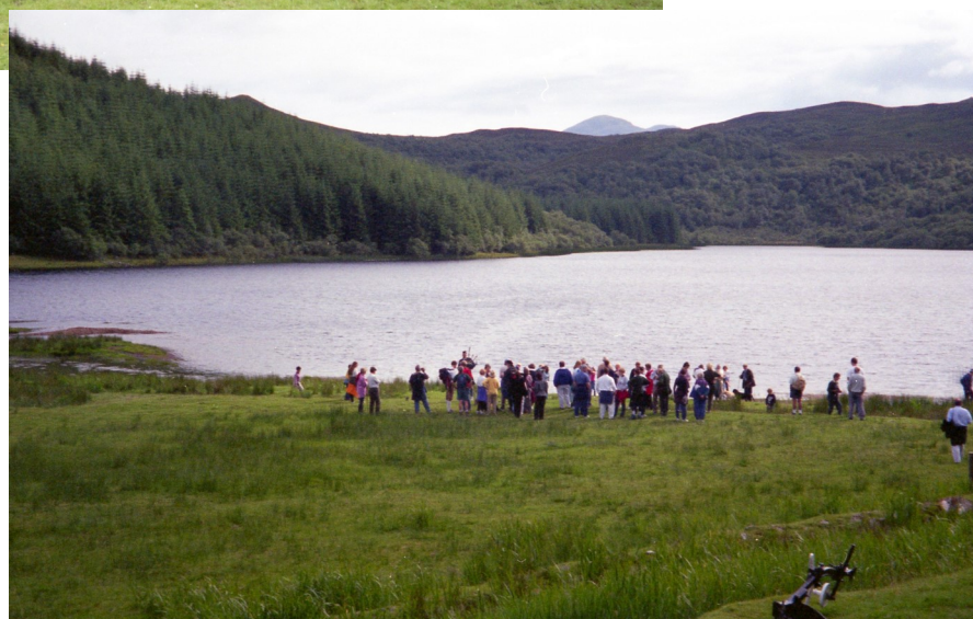
Clan members at Loch Achaidh-na-h-inich, the traditional place where Clan Matheson gathered before going on a raid. Taken in 1998.