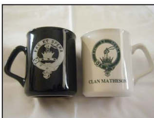
Mugs, white, $10 each Drink Bottle, white, $5 Stubby Holder, Black, $5

To order: Contact Euan McGillivray euanmcgillivray51@gmail.com 0438 133770