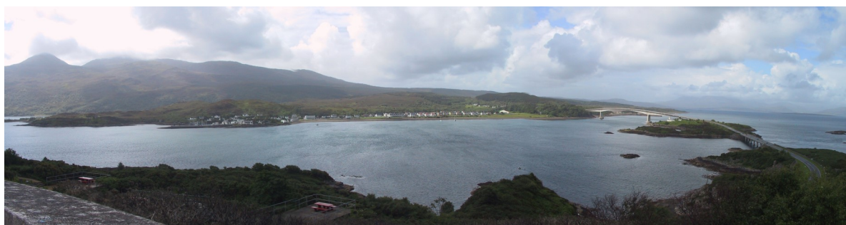
Kyleakin (Skye), Loch Alsh and the Skye bridge (right) taken 2004.

https://www.geopunk.co.uk/locality/ES002246