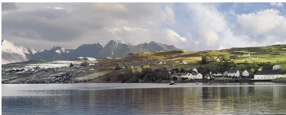
Talisker Distillery, Skye. With the snowy Cuillin mountains behind.