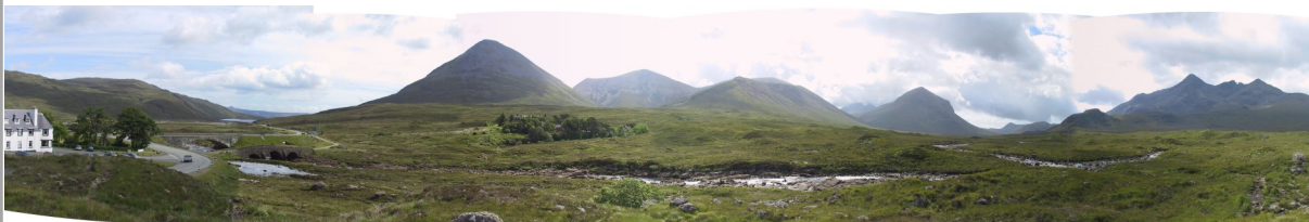
The Cuillins taken from the Sligachan Hotel Skye in 2004