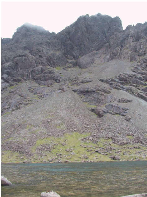
Sgurr Alastair (Cuillin mountains) and Coire Lagan near Glen Brittle, Skye. Taken 2004.