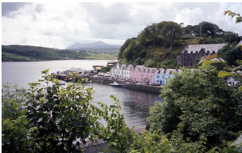
Portree (Skye) harbour with the Cuillin mountains in the background—photographed in 1998

There is a bus service (see link above).