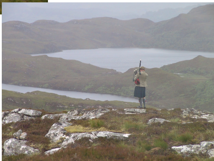
Our Chief playing his pipes on the crags above Duncraig Castle. Lochan Dubha and Loch Nan Gillean behind.