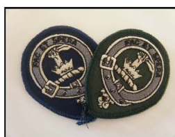
Sew on Clan Crest Patches, Blue, Green $5 each