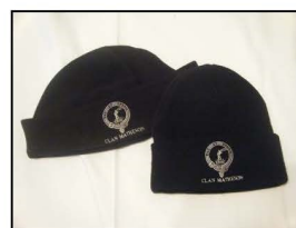
Caps Black, Sand $15 One Size Fits All - Knitted Beanie Navy, Black $15 One Size Fits All Bucket Hats, Sand $15 Sizes S/M or L/XL - Polar Fleece Beanie Navy, Black $15 One Size Fits All