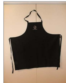
BBQ Apron Black /green $25