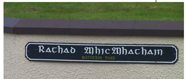
Matheson Rd, Stornoway, Lewis