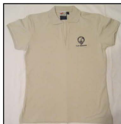
Ladies Polo Shirt Sizes 12, 14, 16 White, beige $25