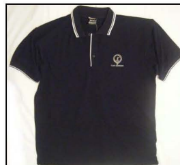
Men's Polo Shirt Sizes M – XXXL Navy, Maroon $25