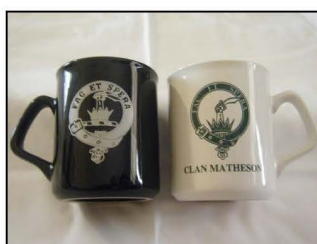
Mugs, white, $10 each Drink Bottle, white, $5 Stubby Holder, Black, $5

To order: Contact Euan McGillivray euanmcgillivray51@gmail.com 0438 133770