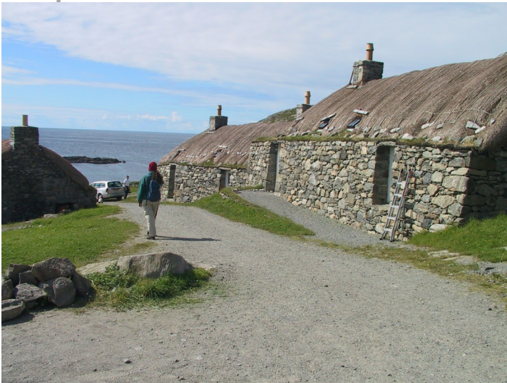
Garenin, Blackhouse Village, Lewis