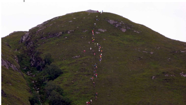
Telephoto of hill during the Hill Race 2014—just to prove some of them did make it!